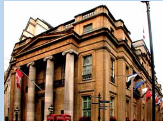
Canada House, London.

For more information visit www.migrationbureau.com or www.visacentre.co.uk